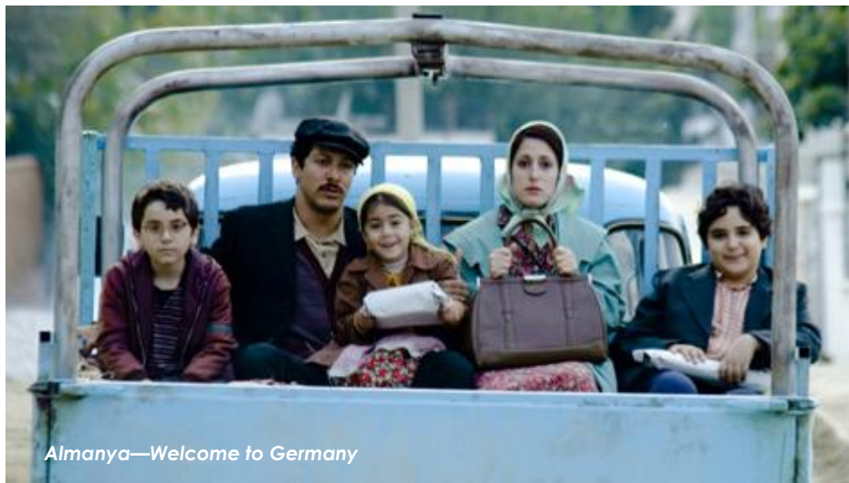
Almanya—Welcome to Germany