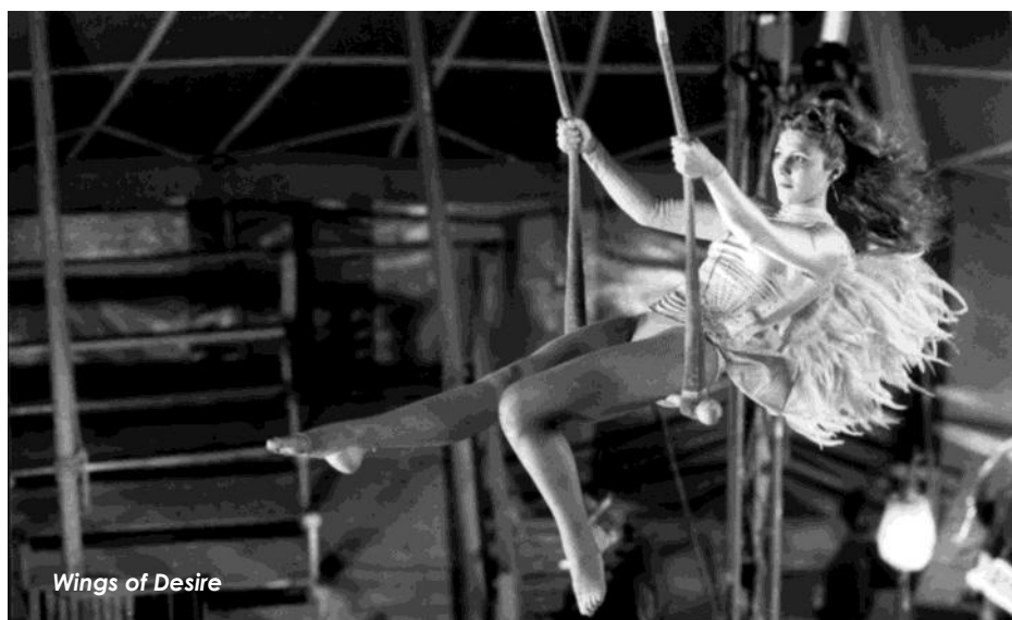
Wings of Desire

Run Lola Run (1999) Saratan (2005) Sascha (2010) Schiller (2004) Sergeant Pepper (2003) Seven Freckles (1978) Sabine Kleist, Aged 7(1982) Silent Light (2007) Six Go Round the World (1971) Sky without Stars (1955) Sleeper (2005) Sleeping Sickness (2011) Slums of Berlin (1925) Sophie Scholl - The Final Days (2005) Soul Kitchen (2009) The State I Am In (2000) Status Yo! (2004) Stopped on Track (2011) Storm (2009) The Story of Little Mook (1953) The Subjective Factor (1981) Summer in Berlin (2005) The Summer of the Falcon (1988) Sumurun (1920) Sun Alley (1998) The System (2011) Tartuffe (1926) Those Days (1947) Three (2010) Three from the Filling Station (1930) Till Eulenspiegel (1974) Titanic (1943) Tough Enough (2006) The Trace of Stones (1966) The Trouble With Love (1983) Those Who Love The Earth (1973) Two Times Lotte (1950 ) Under the Bridges (1945) Unity SPD - KPD (1948) Die Unsichtbare (2011) Urban Guerillas (2003) Vacation (2007) Veronika Voss (1981) The Wall (1990) Warchild (2006) Wengler & Sons, a Legend (1987) Westwind (2011) What A Man (2011) When Memory Speaks (1989) When We Leave (2010) Whiskey with Vodka (2008) The White Rose (1982) Wholetrain (2005) The Wildcat (1921) Wings of Desire (1987) Winter's Daughter (2011) Wintersleepers (1997) The Woman and the Stranger (1984) A Year Ago In Winter (2008) Yella (2007)