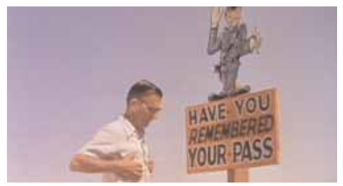
A purpose-built defence village, Woomera once boasted 6000 residents and was heralded as a model of suburban living.