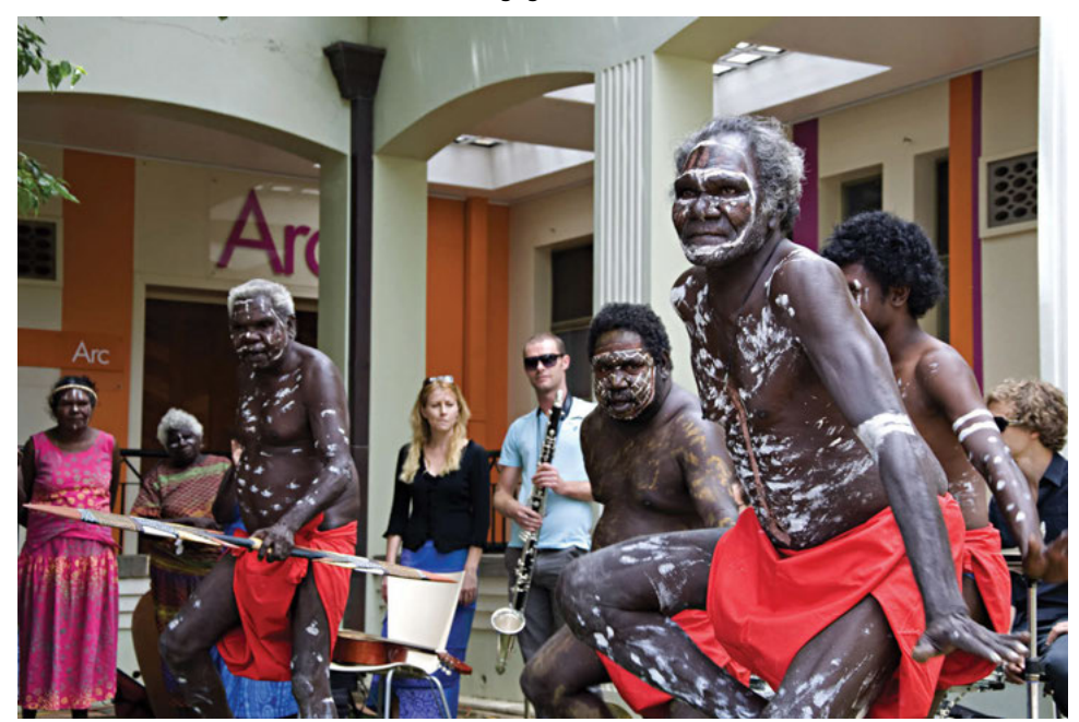
Tiwi dancers performing at the NFSA in Canberra

The extension of deposit legislation to audiovisual and digital material would greatly enhance the NFSA's ability to ensure that a diverse and representative collection of Australian audiovisual materials is available for all Australians to engage with.