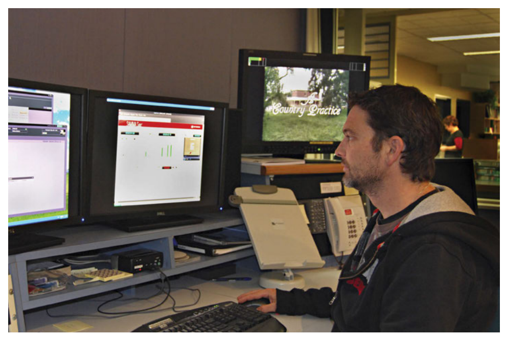
NFSA staff member digitising an episode of A Country Practice

Significant challenges impact upon the NFSA's capacity to meet the Government's goal, including digitisation of the analogue collection, effectively dealing with increasing volumes of digital born new media, improving and increasing collection storage facilities to cater for predicted increases in the collection and legal deposit of audiovisual and associated documents and artefacts. The NFSA looks to collaborations across the GLAM sector and government support to meet these challenges.