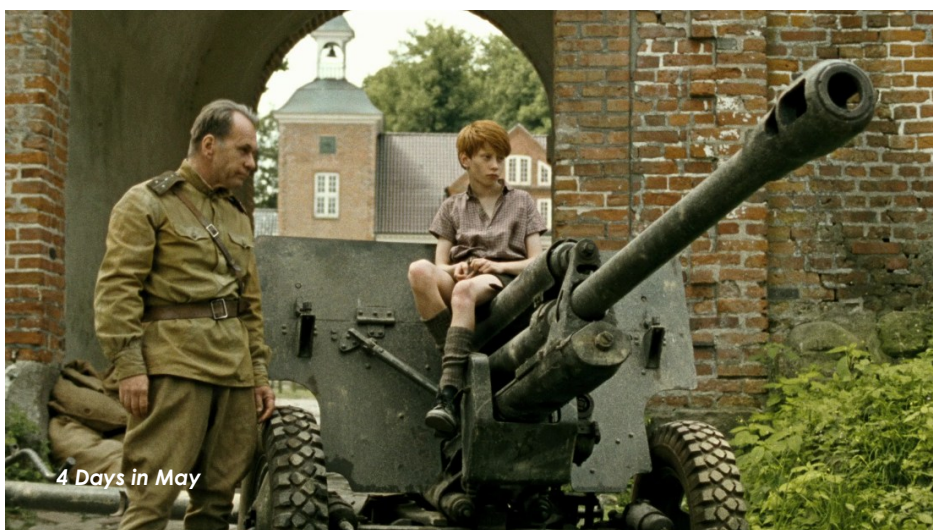
4 Days in May

Four days before the end of WW2 a Russian patrol occupies an orphanage on the Baltic sea. A 13-year-old orphan tries to provoke a confrontation, but the categories 'friend' and 'foe' have long lost their function.