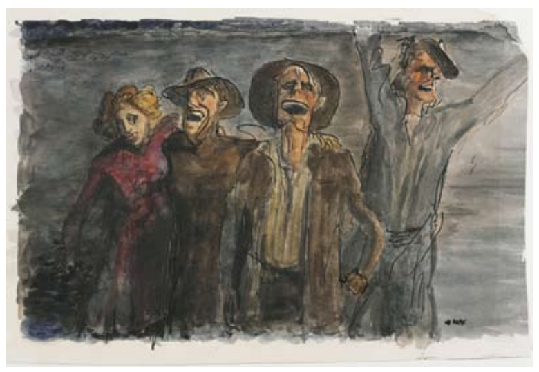
John Brack, Soldiers, 1945, Australian War Memorial.

Forty-two artists were commissioned to cover World War Two, but only two were appointed to Korea and two to the war in Vietnam.