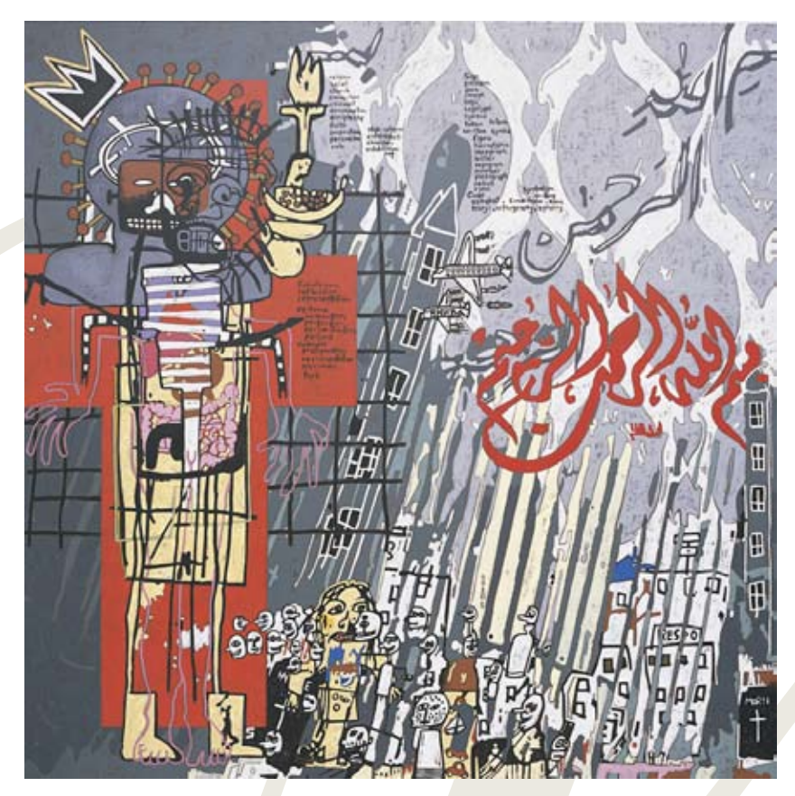
Gordon Bennett, Notes to Basquiat (Aspire), 2002.